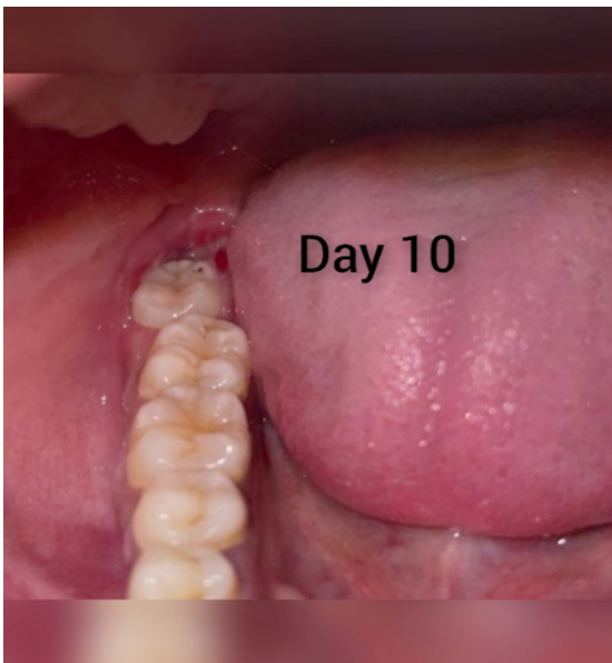
Figure 3. A post-operative follow-up after 10 days revealed adequate and uneventful healing.

mainly in the molar teeth that are beginning to erupt 4 . The patient in our case presented with pain and discomfort in the region of lower right wisdom tooth or the third molar due to the presence of an operculum associated with the tooth. Plaque build-up on the underside of the operculum along with the accumulation of food debris caused inflammation and enlargement of the gingiva. The latter was being easily traumatized at the time of mastication, subsequently causing pain and discomfort. Operculectomy with diode laser was the chosen treatment plan as it presented with numerous advantages over the conventional scalpel surgical procedure. Its benefits in soft tissue surgeries include enhanced accuracy, easily achieved hemostasis, less necrosis of tissue from heat in comparison to electro surgery, the accelerated rate of wound healing, sutureless surgery, decreased post-operative pain, and discomfort with reduced need for analgesics. Most procedures using lasers may be operated with topical local anesthesia alone that results in enhanced patient co-operation along with abridged procedural time. Additionally, the bactericidal effect of lasers on the surgical site means reduced use of antibiotics postoperatively.