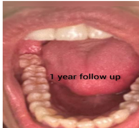
Figure 5. Follow up after 1 year.