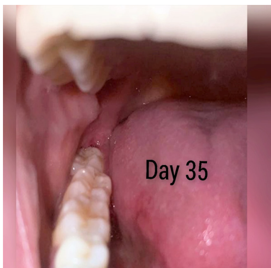
Figure 4. A second post-operative follow up was done at 35days that shows complete healing.