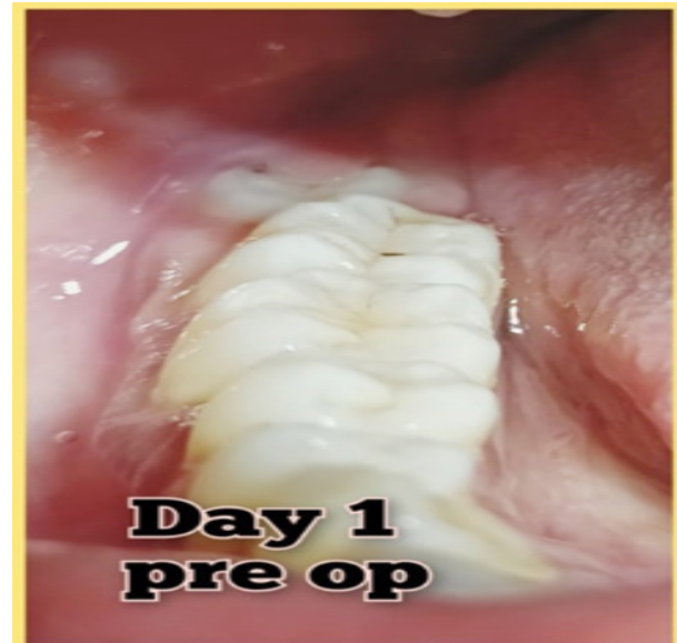
Figure 1. Intraoral examination revealed the presence of an operculum covering the occlusal surface of the upper right first permanent molar.

In this case, the 1 year follow up shows the malposition of the lower right wisdom tooth has not caused cheek bite or traumatic ulcers or other occlusion related problems. The patient is comfortable with the bite and no complaints. Considering this, option of Surgical extraction may be ruled out for this patient.